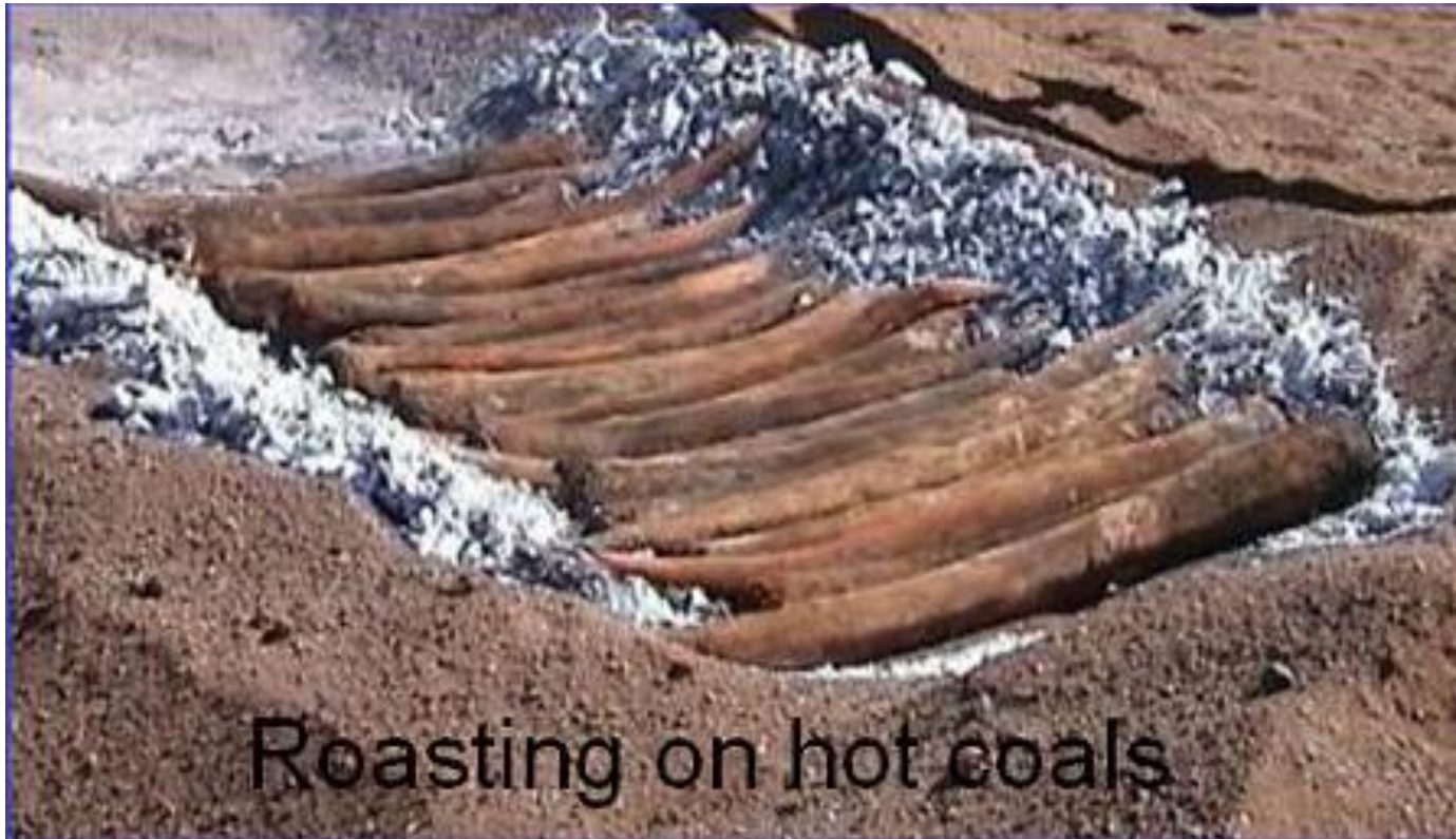
Roasting on hot coals